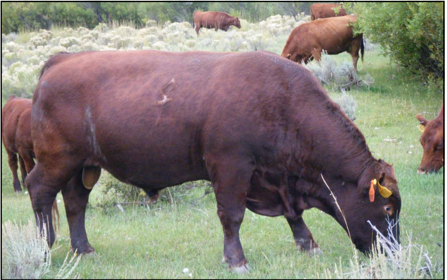
116Y as a 2-year-old in late summer, at the end of breeding season.