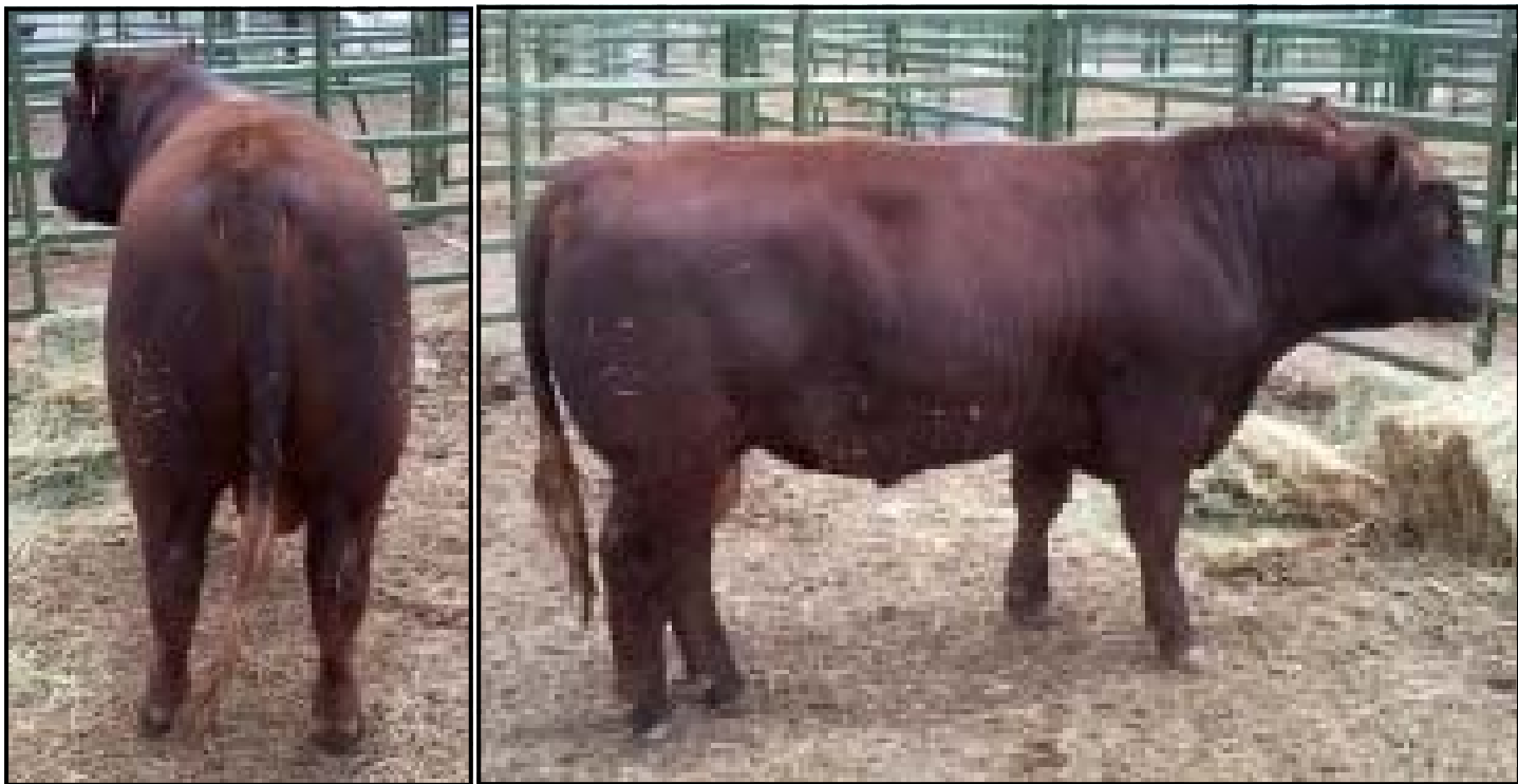
116Y right off the truck as a yearling