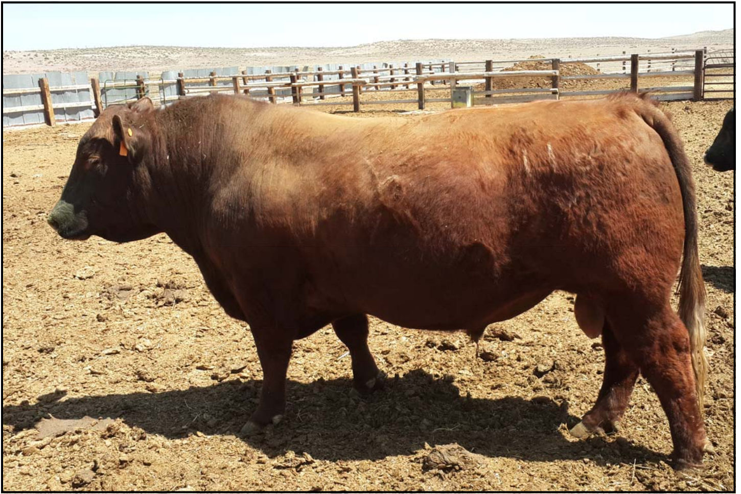
116Y as a 3-year-old in the spring, before breeding season.