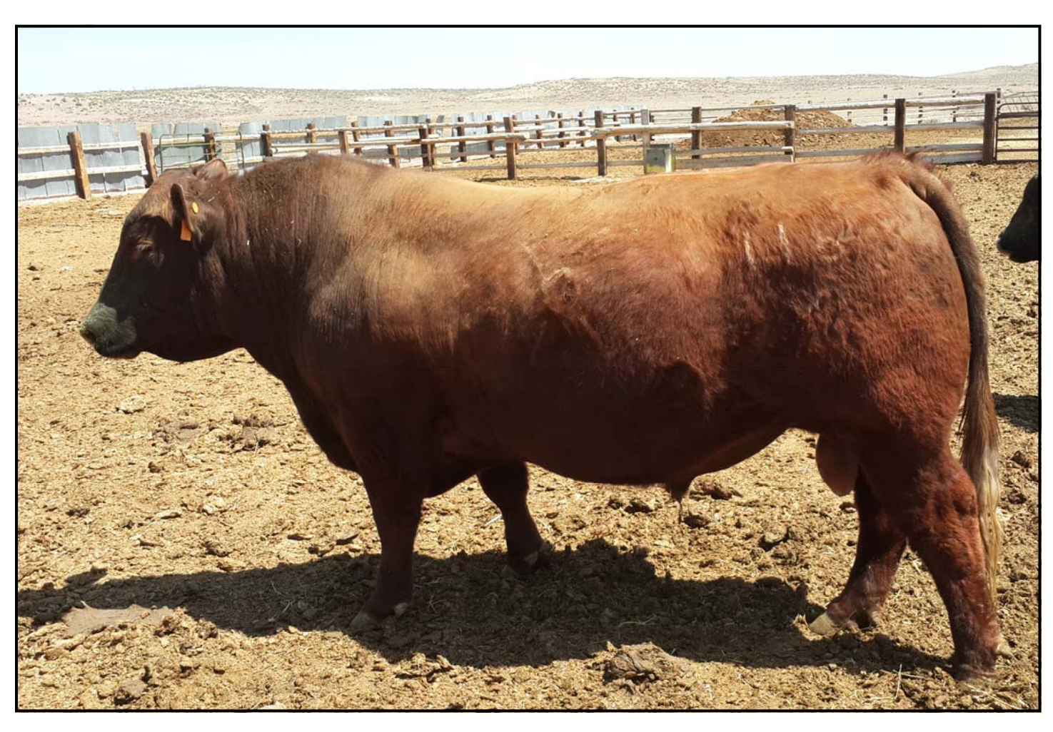
116Y as a 3-year-old in the spring, before breeding season.