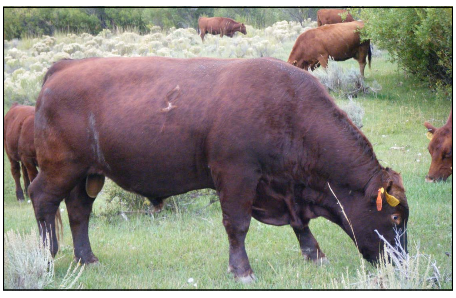
116Y as a 2-year-old in late summer, at the end of breeding season.