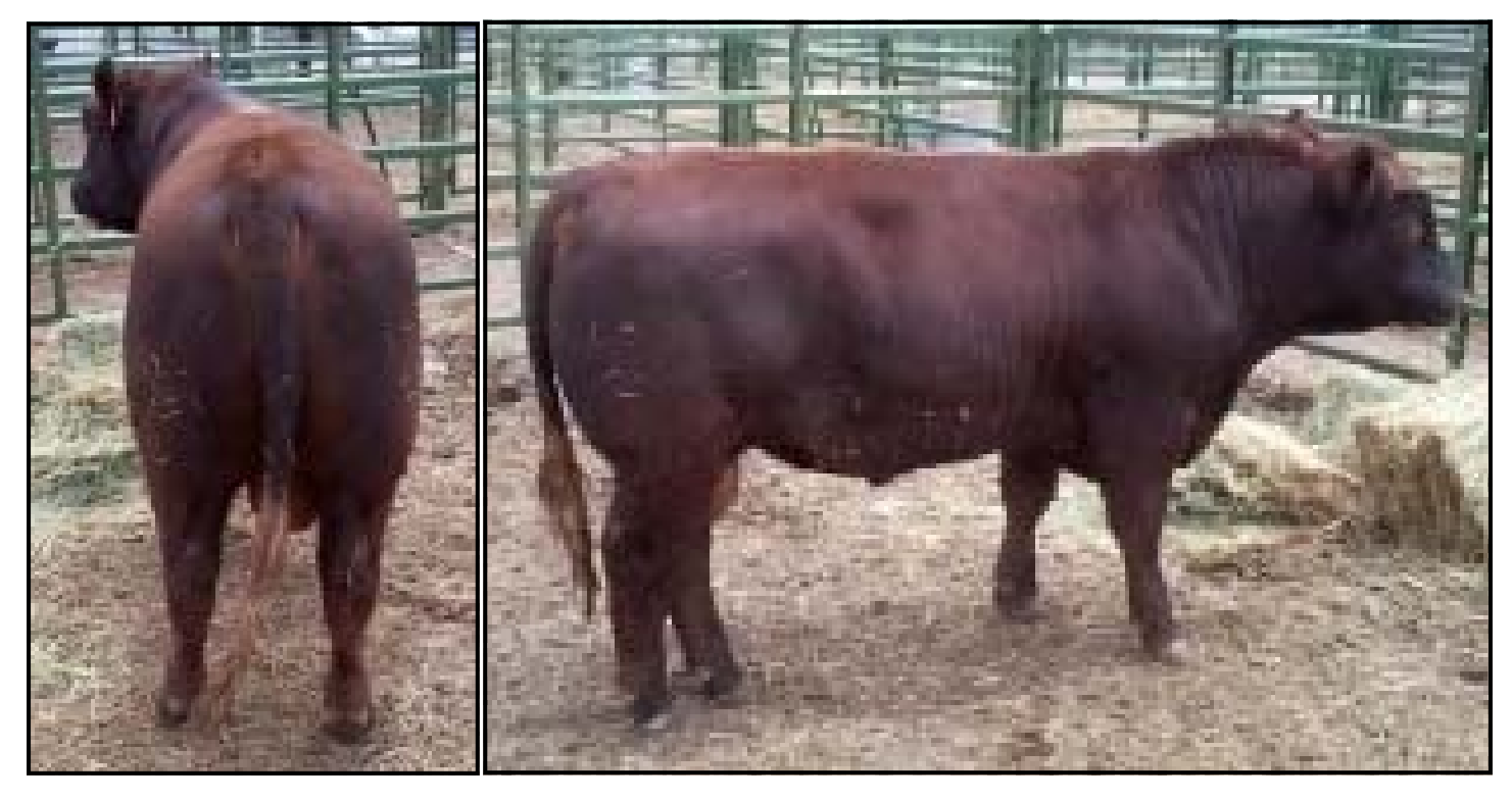
116Y right off the truck as a yearling